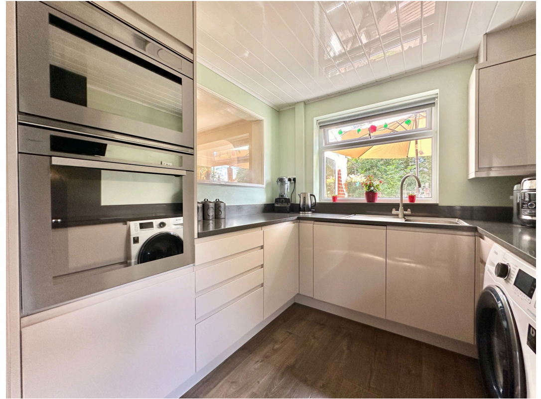
Packer Avenue, Leicester Forest East